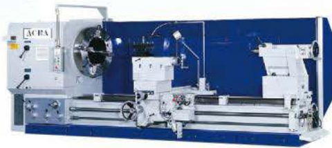
SGT51120 WITH 21" SPINDLE BORE